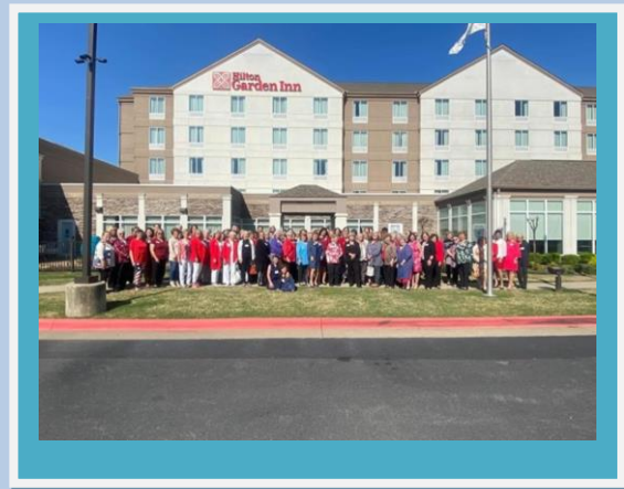
Over 120 Women from across the State!!